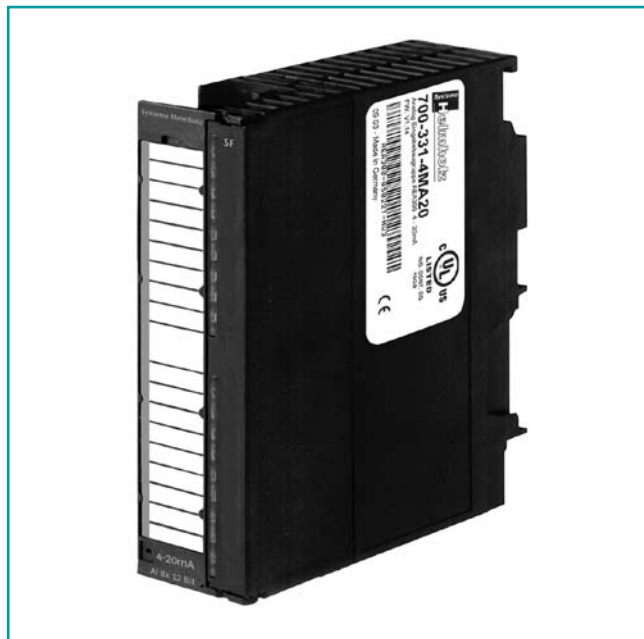
Analog input module

The analog input modules from the Systeme Helmholtz GmbH convert the analog signals from the process to the internal signal level of the programmable controllers.