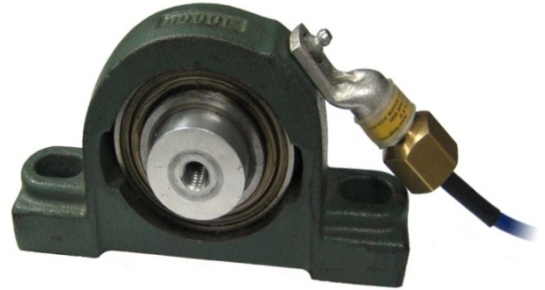
WDB70V3C Installed on Bearing Housing