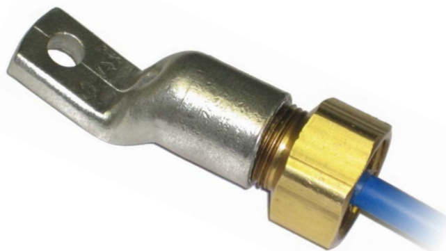
WDB7 Series Bearing Sensor (ATEX and IECEx Approved)

The WDB7 series is a lug style NTC thermistor or platinum RTD (PT100) type for continuous temperature monitoring. It is designed to bolt directly onto a bearing housing, motor, gearbox, or machine casing. The mounting hole is M8 which can be drilled out up to M10 diameter. The sensor can be connected to a PLC or to a hazard monitoring system, such as 4B's T500 Hotbus Elite, Watchdog Elite, or T400 Elite. The connections are not polarity sensitive therefore special connections requirements are eliminated. The WDB7 series is approved for use in ATEX and IECEx Zone 20 dust hazard locations.