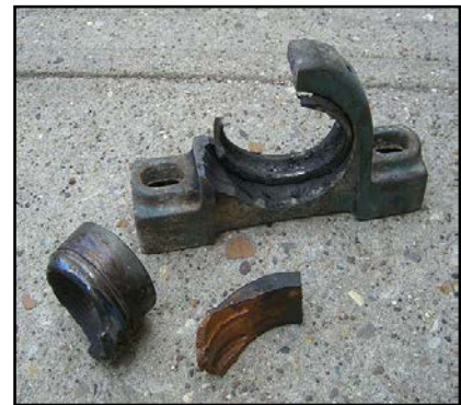
Example of Bearing Failure