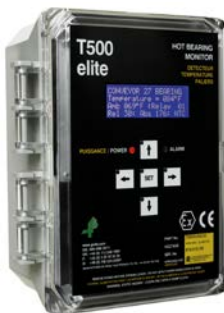
T500 Hotbus Elite

Temperature Sensors can be used with the following 4B Hazard Monitoring Systems